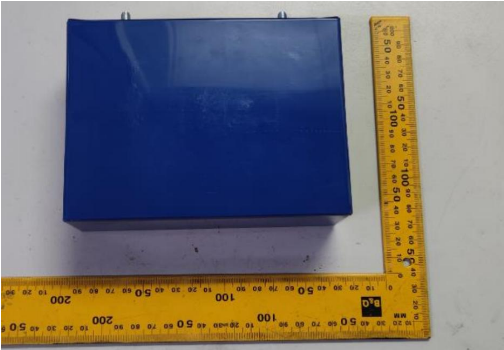
View 1/视图 1