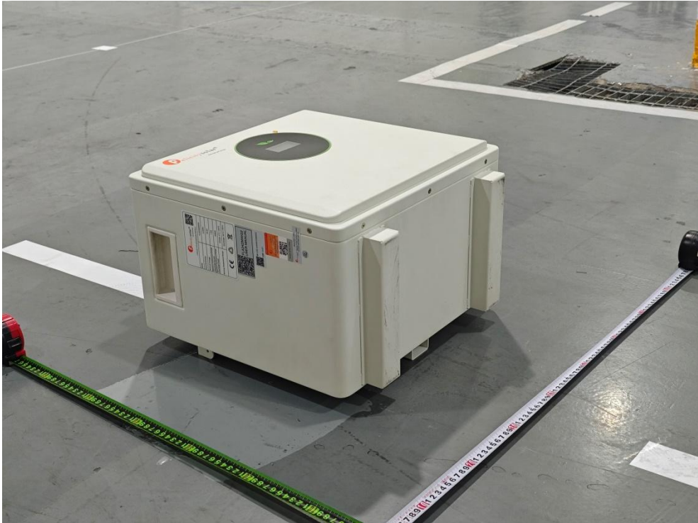
Battery System: FLA24250WG2, 25.6V, 250Ah, 6.4kWh