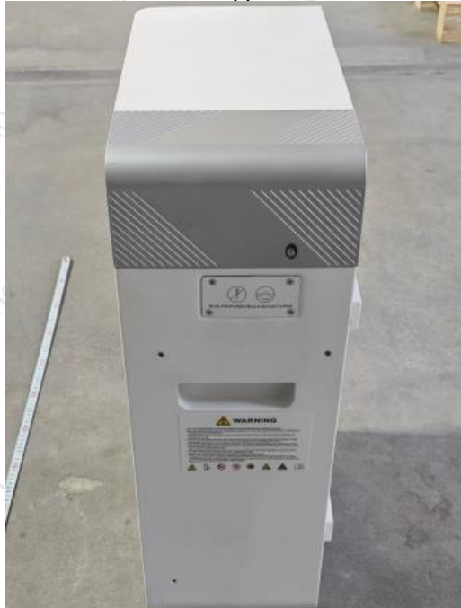
产品外观 Product appearance