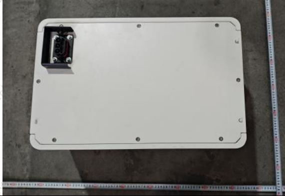
电池正面外观 Battery front appearance